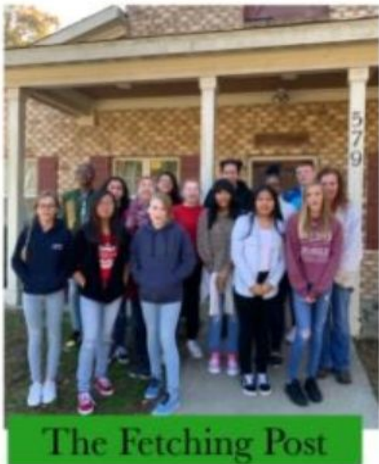
The Fetching Post